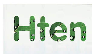
High Definition (HD)